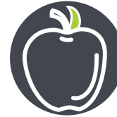
Simply Fit Board Challenge with Healthy lunch