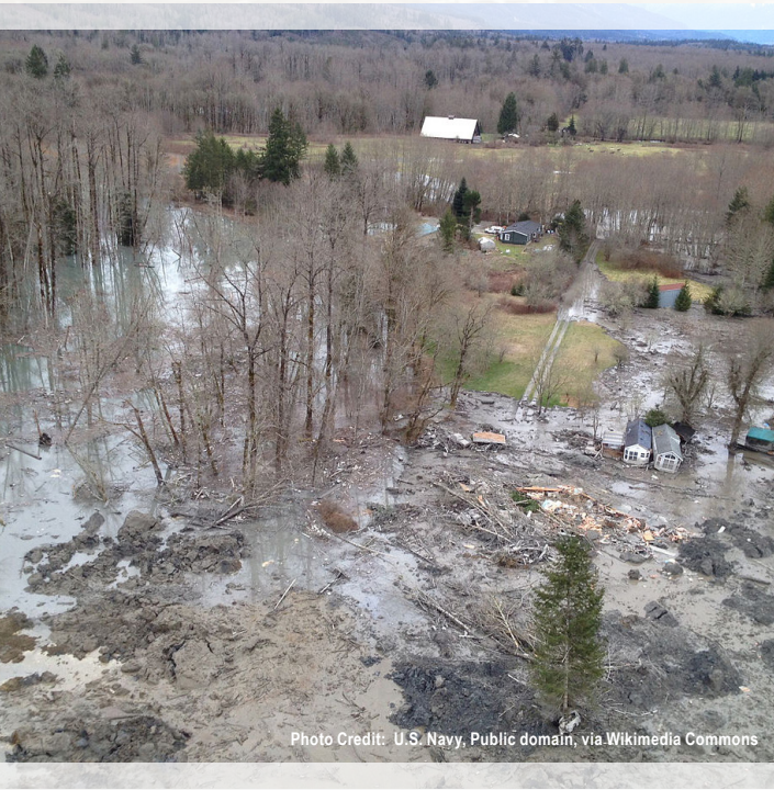
After a massive landslide inundated a community along SR 530 near Oso, WA, SWCA provided archaeological construction monitoring during emergency landslide debris removal.