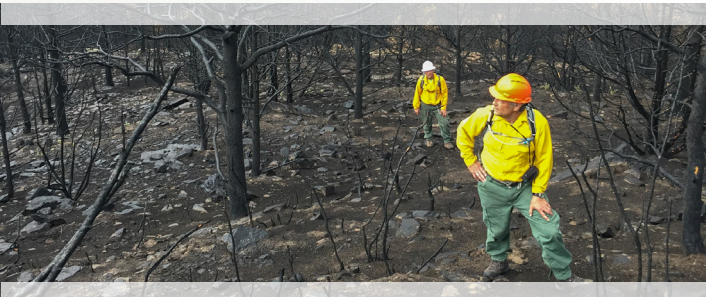
Following the 2018 Ute Park Fire, SWCA completed a Damage Assessment and Burned Area Emergency Rehabilitation Plan for the New Mexico Department of Homeland Security and Emergency Management.