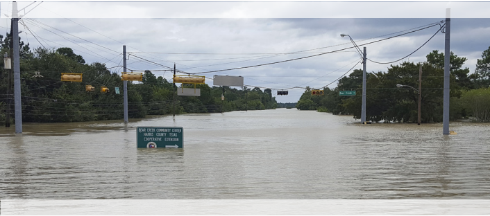
SWCA helped numerous homeowners recover from 2017's Hurricane Harvey through the GLO's Community Development Block Grant-Disaster Recovery program, including 50 counties throughout the state.

YOUR PARTNER THROUGHOUT SWCA will be your trusted advisor through all stages of the disaster lifecycle - in planning and preparation before the next catastrophic event and positioning you to respond effectively and recover quickly from damage that impacts your community. Our goal is to support resilient communities with robust plans of action so you know what risks lie ahead and how to avoid the worst when disaster strikes.