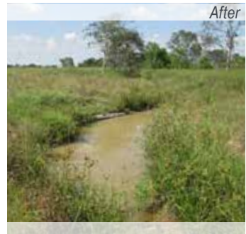
Natural Channel Design for Stream Mitigation