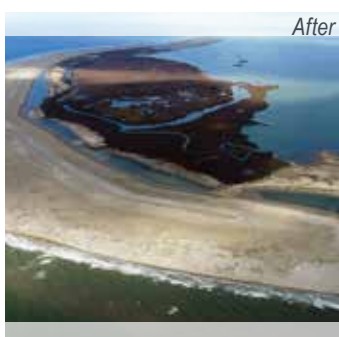
Coastal Headlands - Restoration Construction Oversight