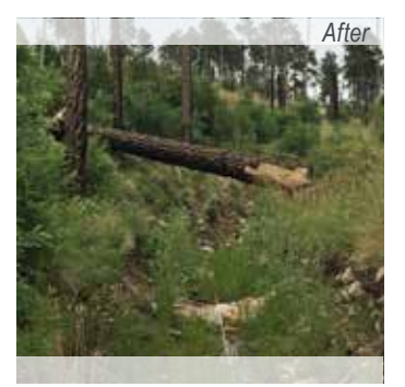
Post Fire Restoration - Channel Stabilization and Revegetation