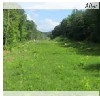
Pipeline Post-Construction Restoration and Monitoring