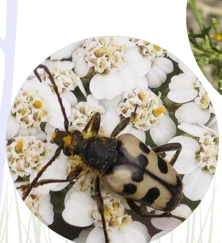
Longhorned Beetles (family Cerambycidae)

are pretty but contain defensive chemicals that can cause painful blisters to those who handle them.