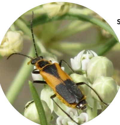
Soldier Beetles (family Cantharidae) may have orange and black warning colors that tell predators "I'm poisonous, so don't touch me!"

There are more kinds of beetles (350,000+) than any other kind of animal. Some species feed on flowers, consuming pollen and nectar and carrying pollen as they move about. Here are a few examples you might find.