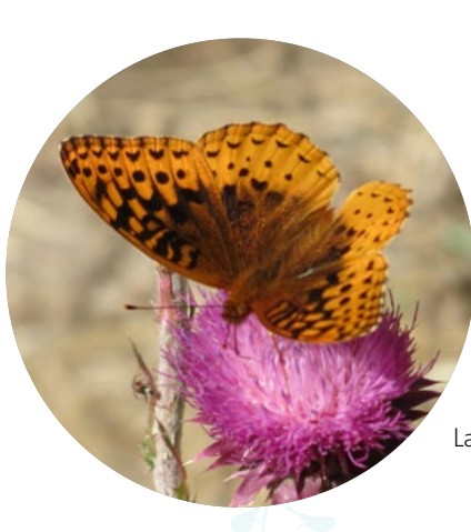
Great Spangled Fritillary

Larvae feed on willows, aspen, chokecherry and serviceberry leaves